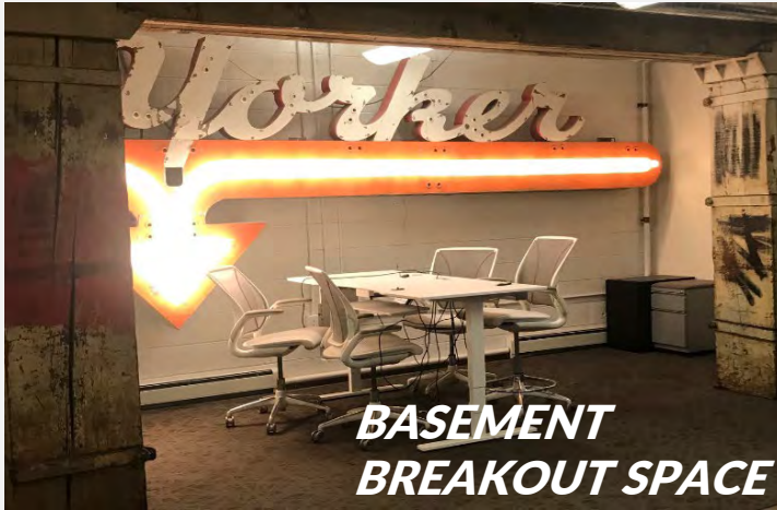
BASEMENT BREAKOUT SPACE