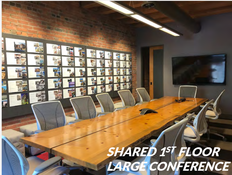
SHARED 1 ST FLOOR LARGE CONFERENCE