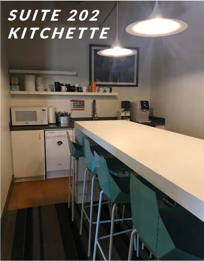
SUITE 202 KITCHETTE