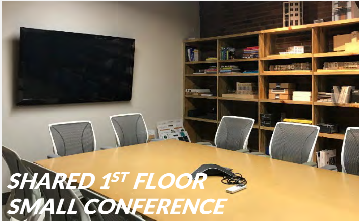
SHARED 1 ST FLOOR SMALL CONFERENCE